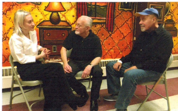
The STAR team provides education, help and the tools needed to stay on the path to recovery.